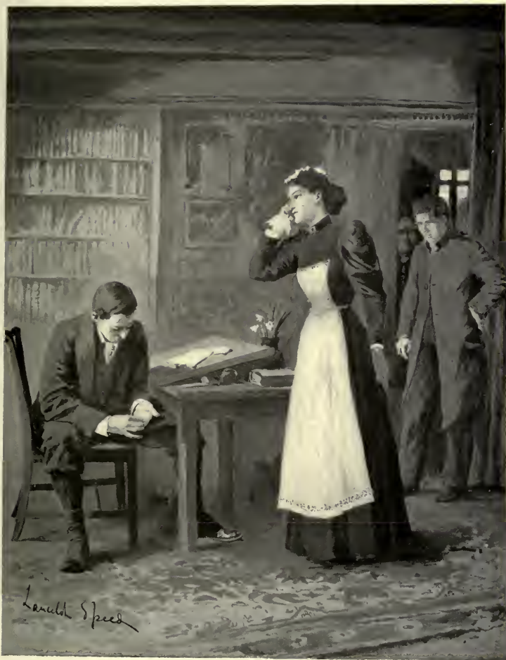
HIS FIRST ACT WAS TO DISCHARGE EVERY SERVANT.—Page 45.